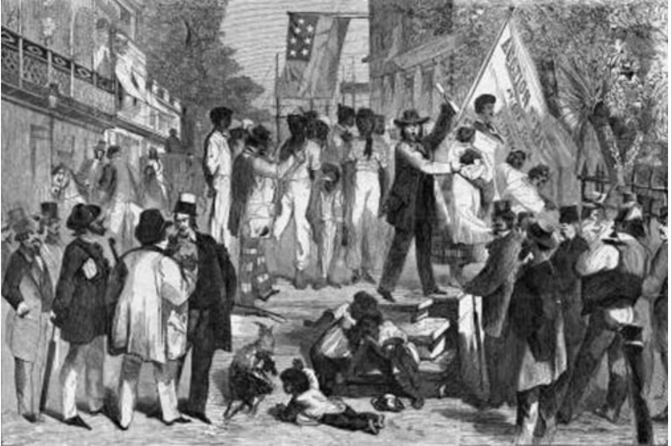
illustration: Harpers Weekly