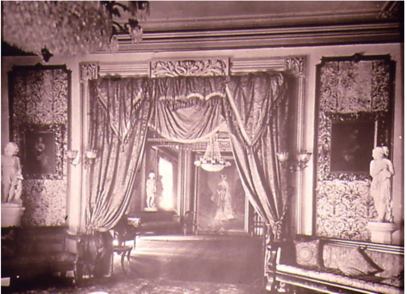
Double Drawing Rooms of Aiken-Rhett House